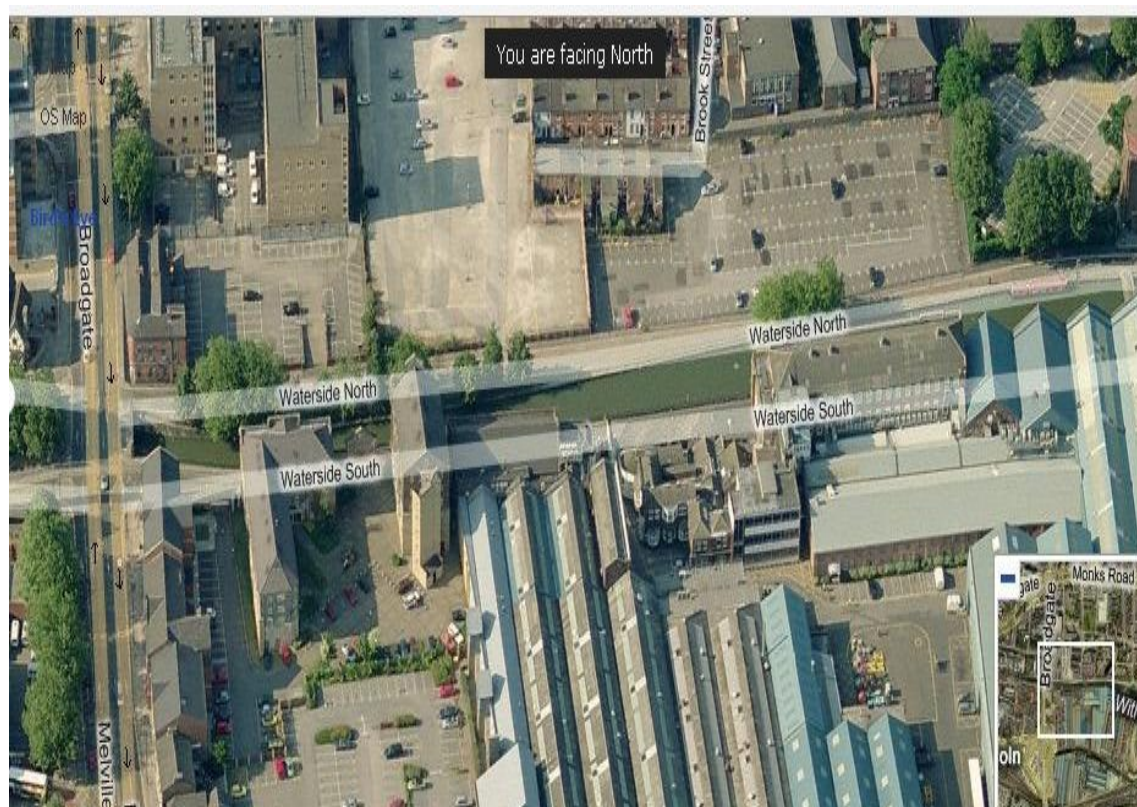
Fig 1 – Access road to trailer park – use Waterside North for Lincoln RC

Access to the LINCOLN landing stage is on the North side of the river via Waterside North. See Fig 1.