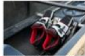
FOOTPLATE & BOLTS