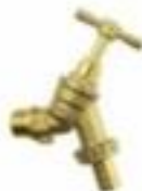
TAPS & HOSEPIPE