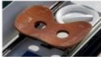
SEAT & HATCH COVER